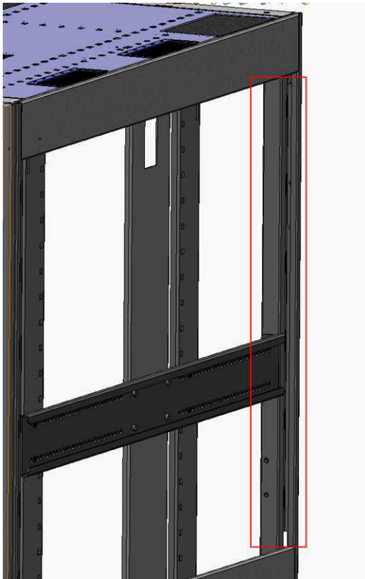
HS Frame – No toolless holes on the backside of the frame.

The toolless mounting holes on the backside of the frame of the NetShelter HS have been removed. See below: