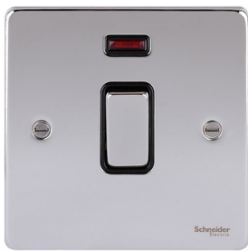
Plate switch, Ultimate Low profile, 2-pole, screw terminals, IP20, chrome