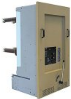
MG MV breaker